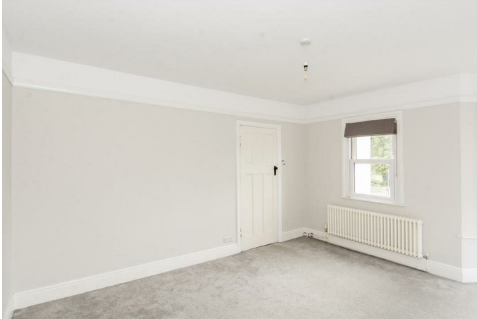
Bedroom Two 12'5" x 12'11" (3.78m x 3.94m)

Double-glazed bay window, with fitted blinds, to the front. Radiator. Picture rail.