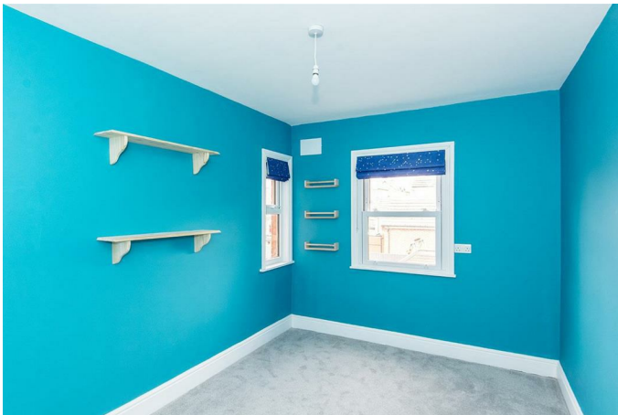
Bedroom Three 12'11" x 8'10" (3.94m x 2.69m)

Double-glazed window, with fitted blinds, to the rear and side elevations. Fitted shelving. Radiator.